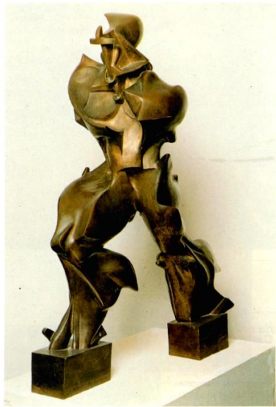
Image 1: BOCCIONI, Forme uniche nella continuità dello spazio (1913)