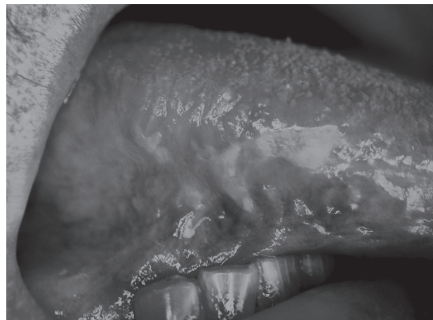
Figure 2. Intraoral clinical image of an 84-year old woman without history of smoking and alcohol consumption showing an opaque plaque in tongue (right side), with smooth and rough surface. Carcinoma in situ .