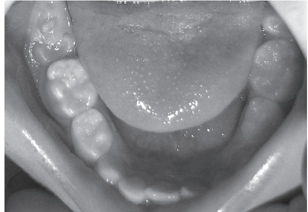
Figure 1. Clinical aspect with tissue overlying occlusal surface of the mandibular right first molar.

hard consistency and irregular shape, located on the occlusal surface of the erupting mandibular right first molar (Fig. 1). There was neither history of pain nor evidence of dental caries or abnormality in other soft tissues. Periapical radiograph did not show adequately this fragment. The treatment plan included surgical removal of this fragment. A biopsy of the area was excised under local anesthesia. The extracted fragment