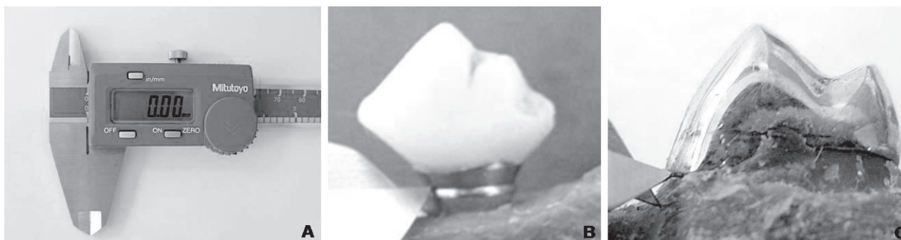
Figure 2. In situ measurements of the alveolar bone crest heights 16 weeks after crown placement (38 weeks after the beginning of the study). A: Digital caliper used in the study. B: In Group I (implant-supported crowns), the measurement corresponded to the distance between the implant platform and the top of the alveolar bone crest; C: In Group II (tooth-supported crowns) the measurement corresponded to the distance between a reference point at the cervical margin of the crown and the top of the alveolar bone crest.