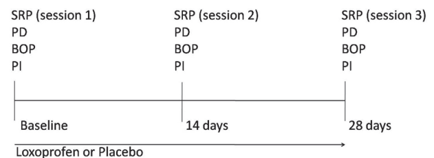
Figure 1. Study design and timeline. All 60 patients had their clinical measurements recorded at baseline, 14 and 28 days. Scaling and root planning was performed in 2 sessions, half-mouth at the baseline and the remaining contra-lateral teeth after 14 days. Two groups were determined based on the Loxoprofen or placebo intake as an adjunct to the non-surgical periodontal therapy. Loxoprofen dosage was 60 mg/day during 28 days. Placebo pills were identical to the real medication to keep the patients and operator blinded. Probing pocket depth (PD), Bleeding on probing (BP) and Plaque index (PI).

The clinical measurements per patient were assessed. The mean and standard deviations were calculated and non-parametric analyses were performed using statistical software (Statistica for Window; StatSoft, Inc., Tulsa, OK, USA). The number of sites