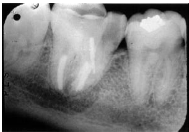
Figure 5. Three-month recall radiograph showing the repair of the periapical and lateral root areas.