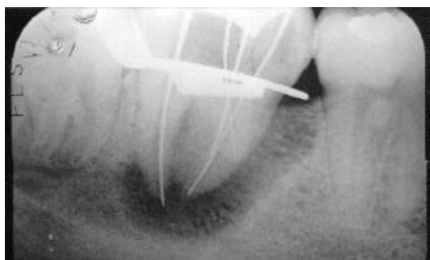
Figure 3. Radiograph with instruments in root canals for working length determination.