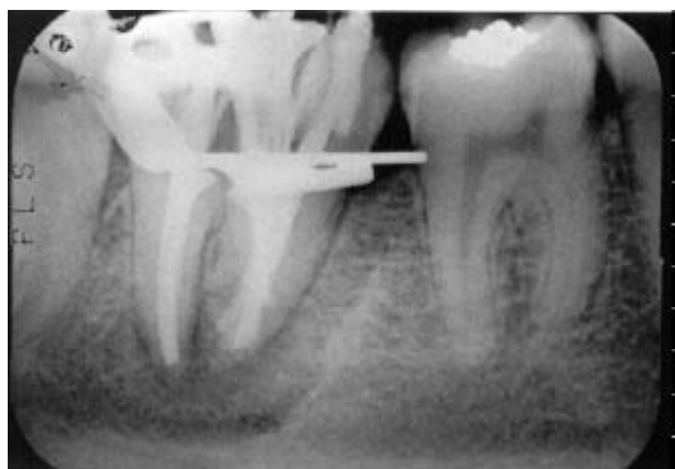
Figure 4. Lateral condensation radiograph. Note that periapical repair has progressed well.