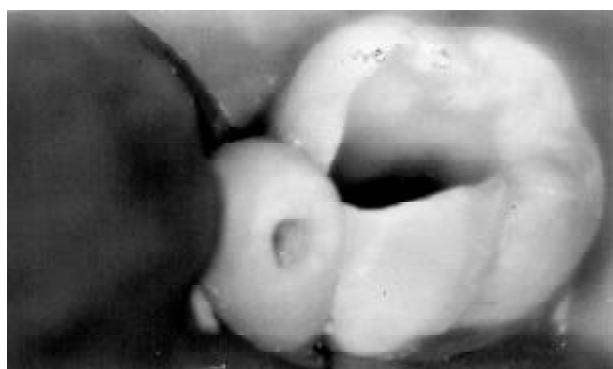
Figure 2. Intraoral view of access cavities occlusally in tooth and in extra cusp.

The terminology dental fusion and gemination are used to define two different morphological dental