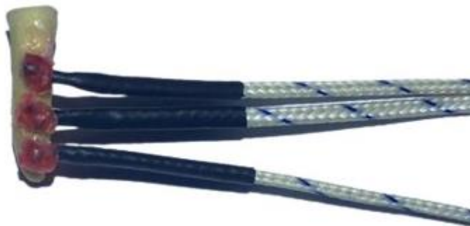
Figure 3. Type K thermocouple sensors fixed in the cervical, middle, and apical thirds of the tooth.

T3 sensor: Positioned 12mm from the root foramen, representing the cervical third.