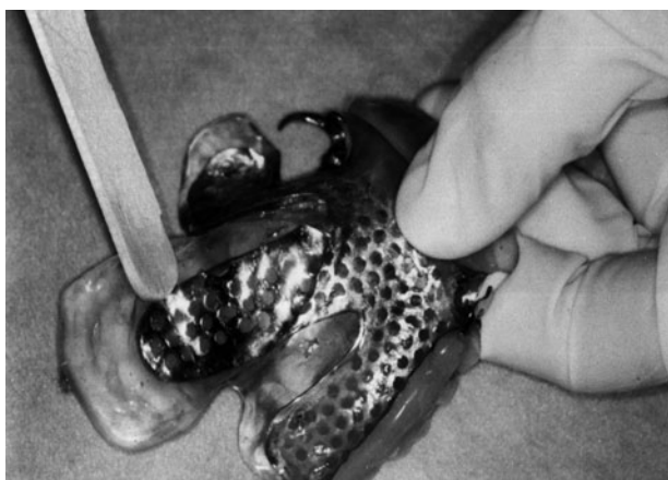
Figure 1. Nasal side of a palatopharyngeal obturator prosthesis.

Oral candidiasis is the most frequent clinical infection of the oral cavity and oropharynx in irradiated patients (9). Radiation therapy administered to patients