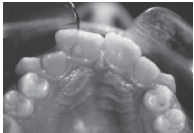
Figure 3. Palatal appearance of the maxillary permanent incisors.