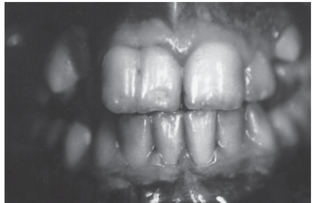
Figure 2. Buccal appearance of the maxillary permanent incisors.