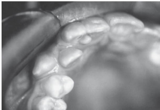
Figure 4. Palatal view showing the talon cusp in detail.

Even though mesiodens, microdontia, dens evaginatus on posterior teeth, shovel-shaped incisors, dens invaginatus or Carabelli tubercule overgrowth