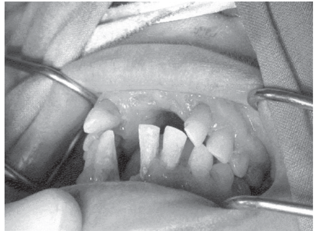
Figure 1. Intraoral clinical examination revealed tooth mobility, deep periodontal pockets, furcation lesions, gingival bleeding and heavy plaque deposits.

Almost all teeth were severely destroyed and/or periodontally compromised. The patient and her family were clarified about her oral conditions and a decision was made for full-mouth tooth extraction and subsequent prosthetic rehabilitation. Before exodontia, medical consent was obtained and routine laboratory tests were done. The surgical procedures were scheduled in blocks under general anesthesia. The postoperative course was uneventful. Five months after extractions, the panoramic radiographic control did not show radiographic alterations suggestive of bone malformation (Fig. 3).