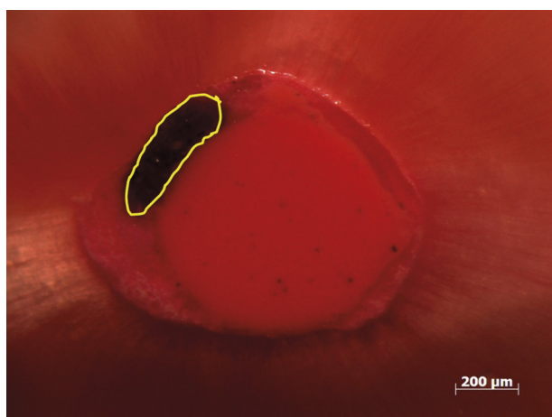
Figure 1. Stereo microscopic image showing failure in the root canal filling - yellow circle.

After analysis with stereo confocal laser scanning microscopy, the images were recorded in CD ROM. Image J software (National Institutes of Health, Bethesda, MD, USA) was used for both analysis and data tabulation. For the images generated by the stereo microscope, area values were calculated in mm 2 for calculation of total circumference of root canal, the area filled with