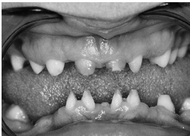
Figure 3. Preparations of the maxillary and mandibular teeth.

The initial stage periodontal therapy consisted