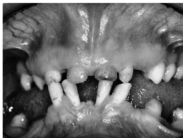
Figure 1. View of the maxillary and mandibular teeth in occlusion revealing neither anterior open bite nor gingival enlargement around the teeth present in the oral cavity. Tooth crowns are clearly seen as clinically short and featured with yellow-brown colored surfaces.

Radiographically, the enamel layers of all teeth