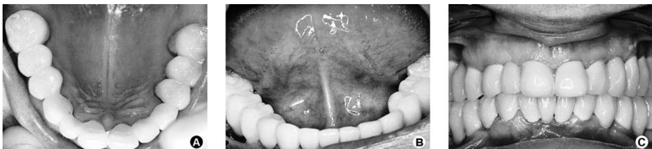
Figure 4. Intraoral clinical appearance after the completion of the restorative treatment. A = View of completed maxillary restorations. B = View of completed mandibular restorations. C = Post-treatment view of the teeth in maximum intercuspation.

Clinical presentation of the AI varies according to its type. In the hypomaturation type, the affected teeth exhibit mottled, opaque white-brown yellow discolored