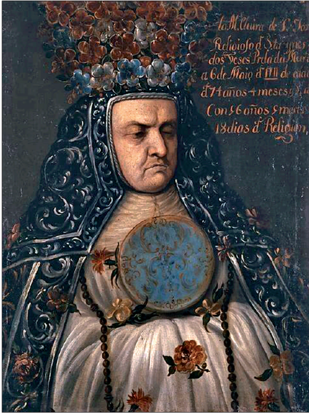
Figure 1. Anonymous, 'Sister Ellvira de San José'. Eighteenth century, oil on canvas.