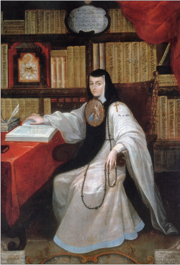
Figure 8. Miguel Cabrera, 'Sor Juana Inés de la Cruz', c. 1750. Oil on canvas, 81 1/2 x 58 1/4." Mexico City.

The continuing contrast between formal portraiture and casta paintings is a significant symptom of evolving class-based differences in seventeenth- and eighteenth-century New Spain. The same artists who painted casta sets tried to exclude indigenous and racially-mixed ( casta ) artisans from the profession and, far from identifying with the miscegenated underclass they depicted so sympathetically, many locally-born artists who painted casta sets claimed pure blood ( limpieza de sangre ) status for themselves (Deans-Smith, 2009).