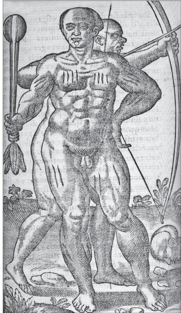
Figure 2. Tupi Warriors. Illustration for Chapters 14 and 15 of Léry (1578). Providence, Rhode Island, John Carter Brown Library.

The visual antitheses in de Léry's illustrations mirror more complicated contrasts described in the text. A dialectic between image and text reinforces certain habits of conceptualization. For example, when de Léry describes the Tupinamba warrior feature by feature, he treats his human subject as if it were a plant or animal to be dissected – something you might study in real life or in a zoological or botanical text, but not the portrait of an individual, someone to engage in conversation, as Alberti (1991) described portraiture in making an absent friend seem present. De Léry explains, moreover, that he has constructed this visual reference with specific contrasting elements for the reader's benefit, so that one can connect the appearance of the Tupi warrior (and I might add, trigger one's memory) with the author's discussion of a nonvisual topic, namely the ritual context in which cannibalism is practiced among the Tupi people. The visual substitution of body decor for war activities makes the subject more attractive and less threatening – as de Certeau (1988b) says, it turns the Tupis into the object of the viewer's pleasure 21 – while the emotionally charged topic of Tupi