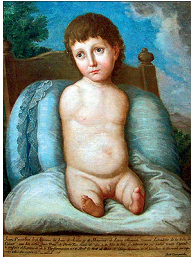
Figure 5. José Campeche, 'Pantaleón Aviles', 1808. Oil on canvas, 27x19. San Juan, Puerto Rico.

horizontal band along the lower border of the painting. Since the sixteenth century, numerous engravings of monstrous human beings, especially of children born with congenital malformations, were in circulation in Europe, often identified as divine portents of impending events (Daston; Park, 1998). However, a different, medical context of viewing has been established for this painting, commissioned from Puerto Rico's leading portraitist by Bishop Arizmendi to send as documentation to the Royal College of Surgeons of San Carlos in Madrid. 30