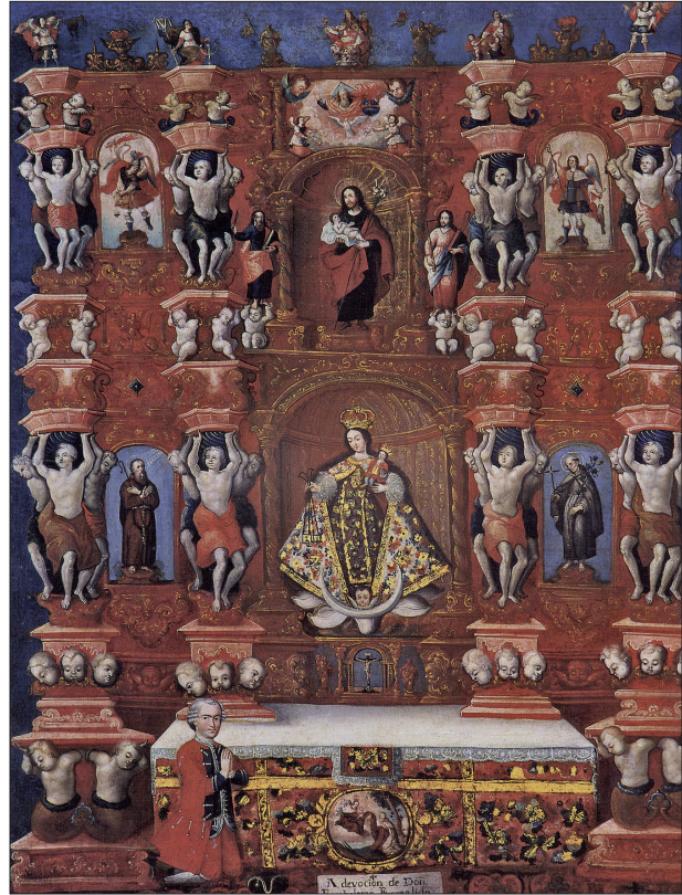
Figure 6. Anonymous, 'La Virgen del Carmen', formerly Cuzco Cathedral, 1776. Lima.

Is it possible that Campeche's representation elicited contemplative questions about the immanence of the divine in nature, even (perhaps especially) from scientifically-minded viewers not given to believing in