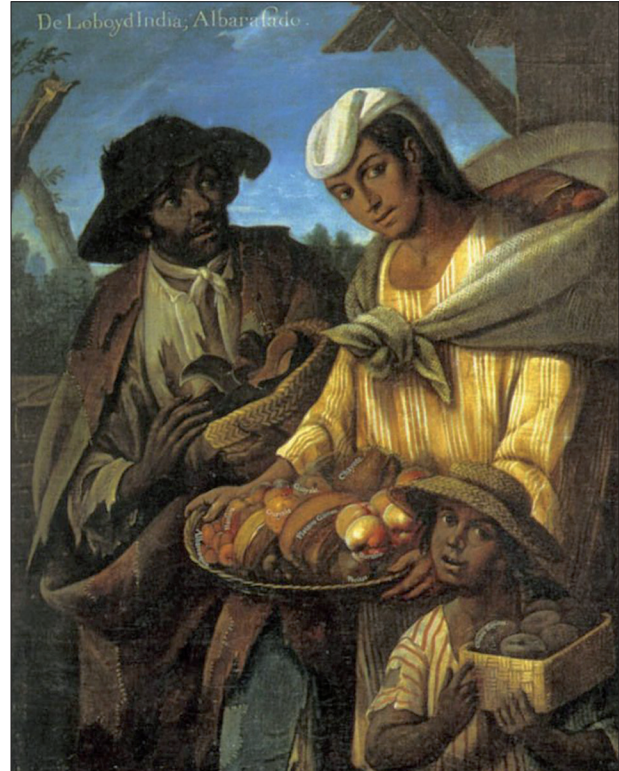
Figure 9. Miguel Cabrera, 'De Lobo y de India, Albarasado', 1763. Oil on canvas, 53 1/3 x 40 3/4." Madrid.

The continuing contrast between formal portraiture and casta paintings is a significant symptom of evolving class-based differences in seventeenth- and eighteenth-century New Spain. The same artists who painted casta sets tried to exclude indigenous and racially-mixed ( casta ) artisans from the profession and, far from identifying with the miscegenated underclass they depicted so sympathetically, many locally-born artists who painted casta sets claimed pure blood ( limpieza de sangre ) status for themselves (Deans-Smith, 2009).