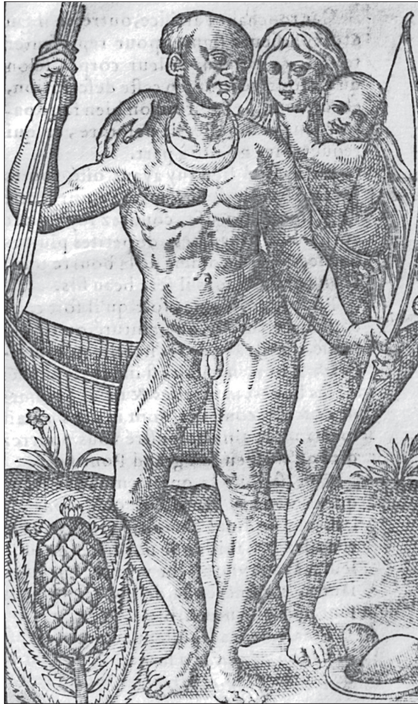
Figure 4. Tupi Family. Illustration for Chapter 8 of Léry (1578). Providence, Rhode Island, John Carter Brown Library.

kind that de Léry's text established, but the secondary elements function differently when they portray a specific individual. What can be said about José Campeche's 1808 painting of Pantaleón Aviles: is this a portrait (Figure 5)? The conventional inscription identifying the sitter appears as a