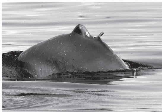
Figure 3. Left side of the body of an adult Guiana dolphin ( Sotalia guianensis ) showing a healed wound provoked by a shark predation attempt which took off the dorsal fin.

The risk of predation may also play a role in determining the size of groups in mammals (Bertram, 1978; Connor, 2000; Heithaus, 2001). To date, there is no published information on S. guianensis predators. Potentially, sharks and killer whales, Orcinus orca (Linnaeus, 1758) may prey upon S. guianensis . However, to date no attacks have been reported, nor is there evidence of scars or mutilated photo-identified individuals. A killer whale was recently witnessed attacking and killing a franciscana dolphin, Pontoporia blainvillei (Gervais & d'Orbigny, 1844) in closer coastal waters (Santos and Netto, 2005), and the only known record of the presence of an individual killer whale was recently reported for the Cananéia estuary (Santos and Rosso, 2007). Interactions between sharks (order Selachii) and dolphins (order Cetacea, suborder Odontoceti) have been reported worldwide (see Heithaus, 2001 for a review of shark predation on dolphins). Such interactions are usually reported from the investigation of stomach contents, from occasional opportunities witnessed in the field, and from observations on wounds and scars on living and dead scavenged individuals. Heithaus (2001) showed that the remains of at least 24 toothed whale species were already found in shark stomachs, but S. guianensis was not listed. On 16 February 2008, during one of the survey days in Canal do Superagui, an adult Guiana dolphin was photographed without its dorsal fin in a group