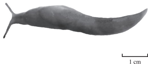
Figure 1. Deroceras reticulatum MLP 12821.