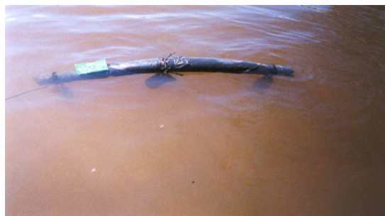
Figure 2. Sampler gadget in Gravataí river, South of Brazil.