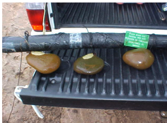
Figure 3. Sampler gadget after the diatom colonization period.

Basaltic cobbles were chosen because they are common in southern Brazilian rivers and also because they have a surface with small porous, making the removal of the attached communities easier.