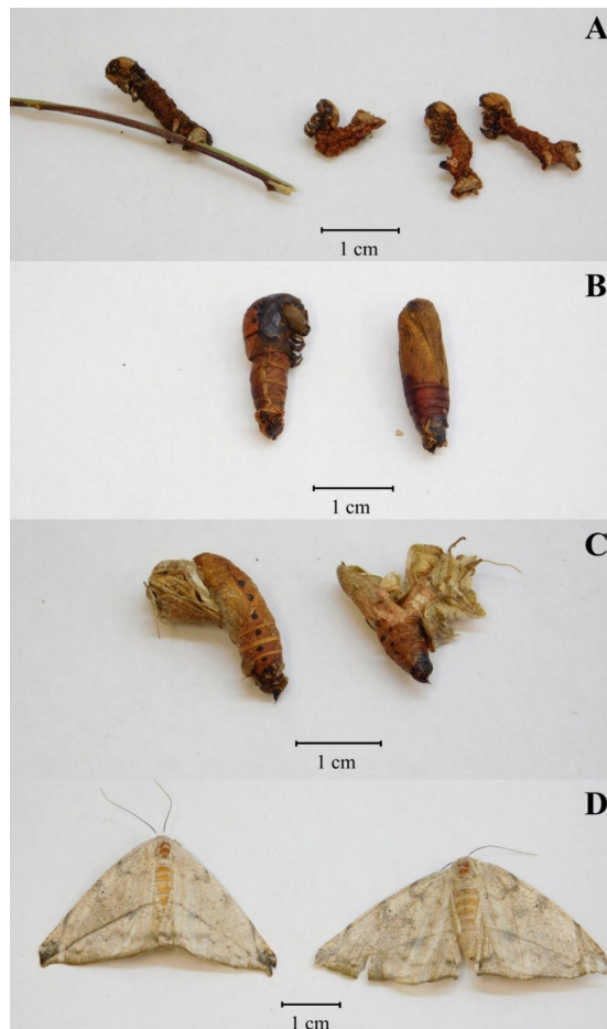
Figure 2. Oxydia vesulia (Lepidoptera: Geometridae) caterpillars that did not reach the pupae stage (A), malformation of pupae and adults (B and C) and adults that survived the Tetrastichus howardi (Hymenoptera: Eulophidae) parasitism (D).