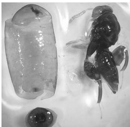
Fig. 5 — Puparium of Philornis sp and the adult wasp found in its interior.