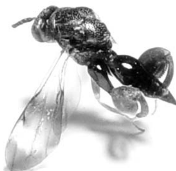
Fig. 3 — Conura annulifera (Walker, 1864) (Chalcididae): dried specimen.