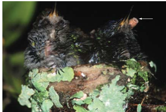
Fig. 1 — Nestlings of Thalurania glaucopis Gmelin, 1788 infested by Philornis sp larvae.

The emerged wasps belong to Conura annulifera (Walker, 1864) (Chalcididae). Burks (1960) described Spilochalcis ornitheia , a junior synonymy of the former, and recorded it as reared