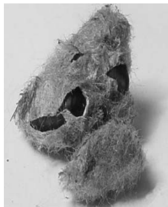
Fig. 4 — Puparia of Philornis sp found in nest of Thalurania glaucopis .