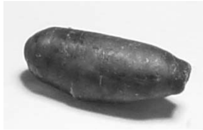
Fig. 6 — Pupa of Philornis sp.

The available data on Philornis species life cycle are very scarce. In Philornis torquans