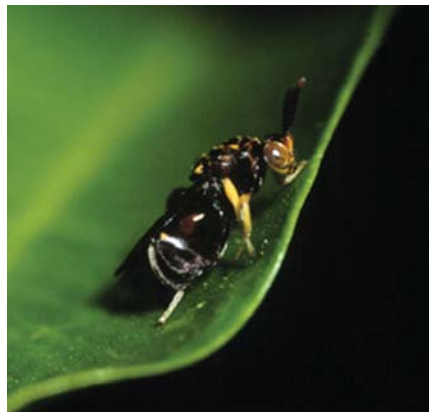
Fig. 2 — Conura annulifera (Walker, 1864) (Chalcididae) recently emerged from Philornis sp. pupa.