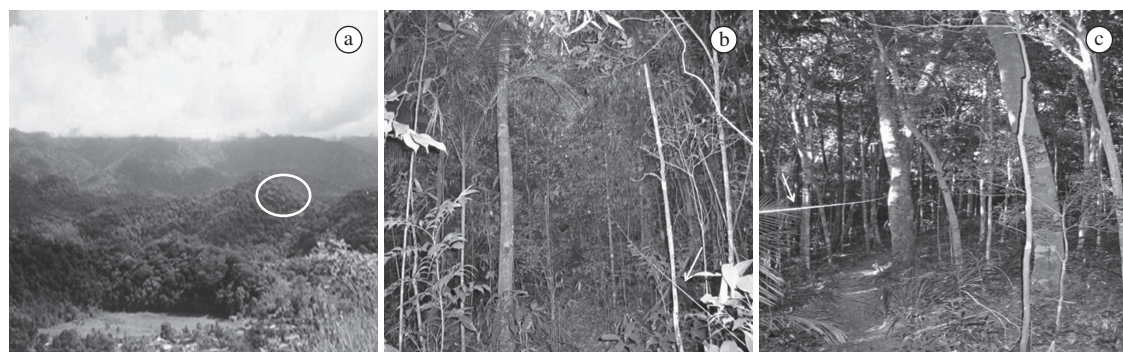
Figure 1. Partial vision of Dense Ombrophylous Forest in "Reserva Biológica do Tinguá". a) The circle shows local study in submontane rainforest; b) Understory relatively dense with high frequency of small trees and bushes; c) Discontinuous canopy in some places is noted. The arrows indicate transects. November/2003.

Ant genera were identified following Bolton (1994), and subfamilies following Bolton (2003). Whenever