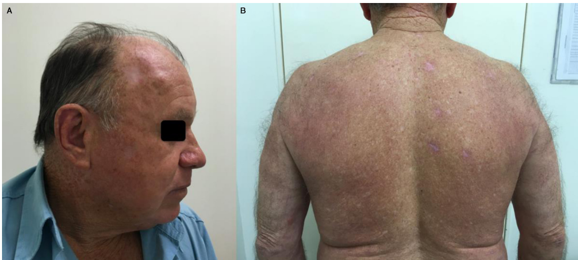
Fig. 3 – Clinical cure after the treatment. (A) Absence of skin and mucosal lesions; (B) hypochromic-atrophic scars on the dorsum.