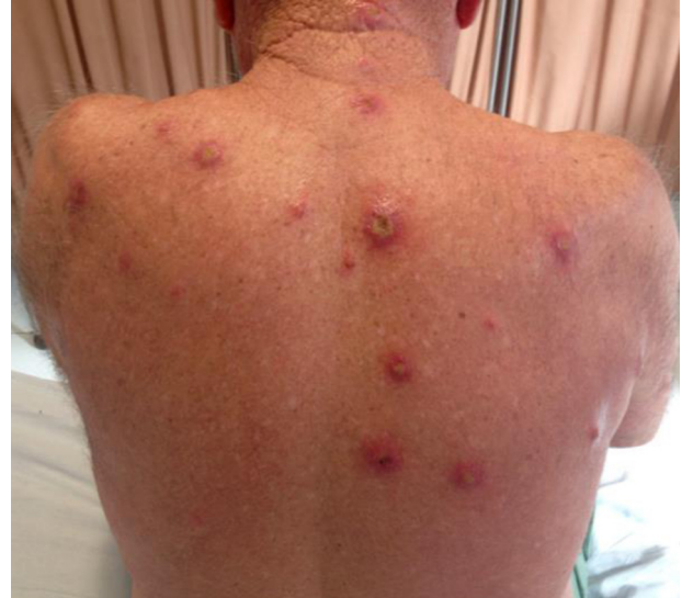
Fig. 2 – Papules, nodules, infiltrated erythemas were found on the dorsum. Induration of the lesions was palpable.