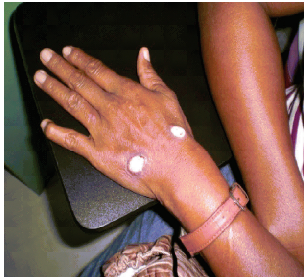
Figure 4: Technique of cryosurgery with liquid nitrogen and halo.