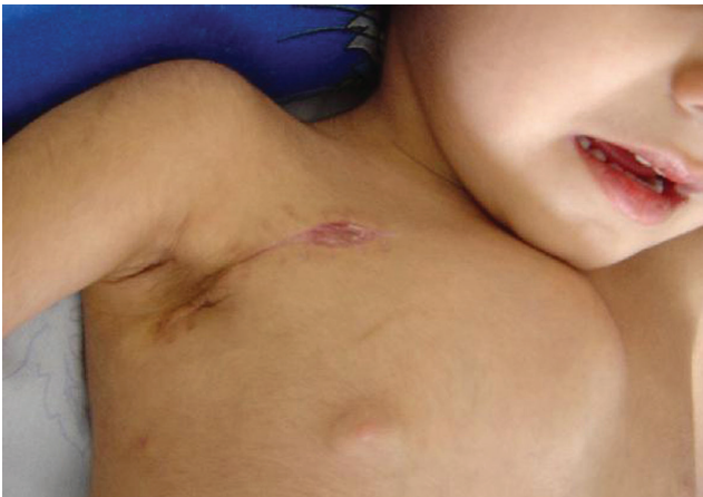
Figure 1: Scar of the lesion in the right axillary region, extended to the right anterior chest wall.

Laboratory tests and imaging studies were performed. The primary laboratory findings were as follows: white blood cell count: 17,800/\text{mm}^3 (neutrophils: 69% and lymphocytes: 31%), hemoglobin concentration: 10.7 g/dL, platelet count: 449,000/\text{mm}^3 , and erythrocyte sedimentation rate (ESR): 118 mm/h. The patient had a 4+ positive C-reactive protein (CRP). Chest roentgenogram (CXR) revealed a homogenous density with an alveolar-filling pattern in the right upper and middle lobes with a small lucency within the upper lobe density, which suggested a cavity forming pneumonia (Figure 2).