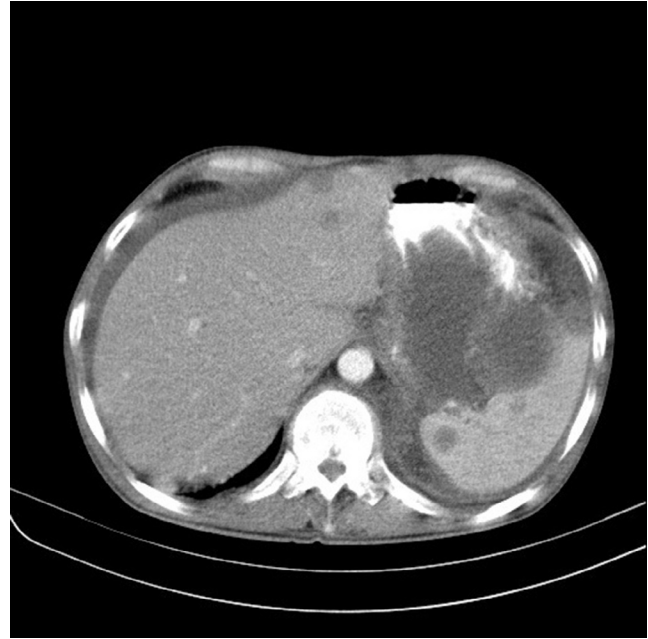
Fig. 1 – Multiple cystic lesions in liver.

like fever, cough, and dyspnea. CXR appearances are mostly seen as bilateral diffuse symmetric finely granular/reticular interstitial/airspace infiltration and most common CT features are patchy work pattern (56%), bilateral asymmetric patchy mosaic appearance. 2,3 However, negative CT does not rule out the diagnosis. While PCP is the most prevalent severe pulmonary infection in HIV-infected patients, extra-pulmonary pneumocystosis is almost rare. Extra-pulmonary Pneumocystis infection occurs in HIV-infected patients on pentamidine prophylaxis or in advanced HIV infection without prophylaxis, even without pulmonary involvement. It can affect all organs