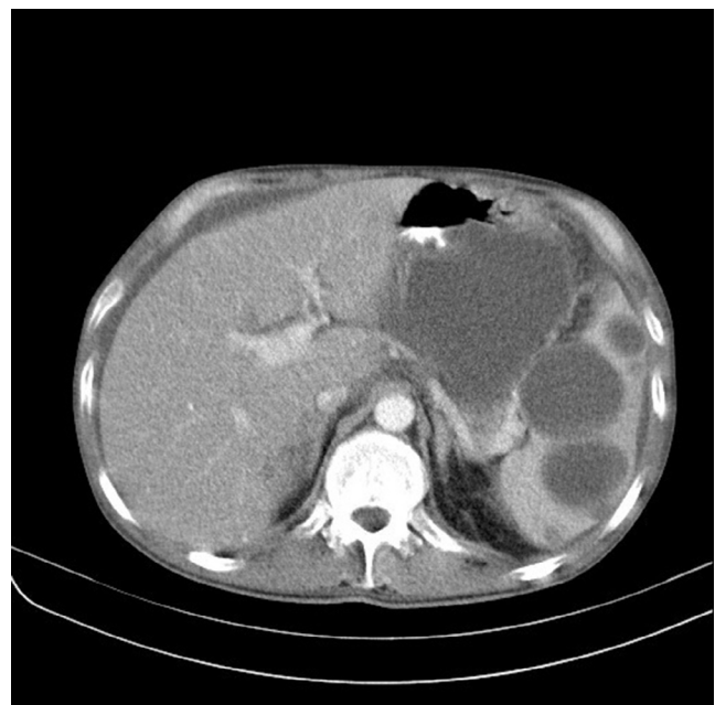
Fig. 2 – Multiple cystic lesions in spleen.

like fever, cough, and dyspnea. CXR appearances are mostly seen as bilateral diffuse symmetric finely granular/reticular interstitial/airspace infiltration and most common CT features are patchy work pattern (56%), bilateral asymmetric patchy mosaic appearance. 2,3 However, negative CT does not rule out the diagnosis. While PCP is the most prevalent severe pulmonary infection in HIV-infected patients, extra-pulmonary pneumocystosis is almost rare. Extra-pulmonary Pneumocystis infection occurs in HIV-infected patients on pentamidine prophylaxis or in advanced HIV infection without prophylaxis, even without pulmonary involvement. It can affect all organs