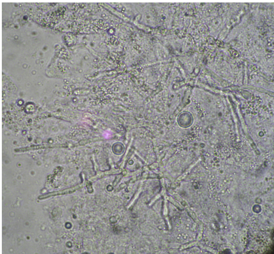
Fig. 1 – K(OH) 40% P/V smear from scrapped lesion in the right palm, illustrating the presence of septate hypha (400×).