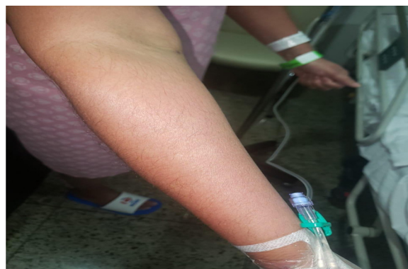
Fig. 3 – Dengue diffuse itchy erythematous-papular rash, mainly located on the limbs and trunk regions, onset on third day of hospitalization.

Brazil, was admitted to a local hospital on April 14, 2020. The patient complained of sore throat, anosmia and ageusia for the past 12 days, and frontal headache, fever, dry cough, mild dyspnea without need for supplementary oxygen and SpO 2 94% on room air for five days. IgM and IgG antibody tests for DENV (SERION ELISA classic Dengue Virus IgM and IgG, Serion Inc., Brazil) were initially negative, whereas real-time reverse transcription – polymerase chain reaction (RT-qPCR) for SARS-CoV-2 (in-house laboratory developed test targeting N1 and E genes 4 performed on a nasopharyngeal specimen) was positive. Blood samples showed leukopenia (2260/mm 3 ), lymphopenia (497/mm 3 ), thrombocytopenia (143,000/mm 3 ), and elevated D-dimer (3986 ng/mL), C-Reactive Protein-CRP (16 mg/L), serum alanine aminotransferase (ALT 60 U/L), aspartate aminotransferase (AST 40 U/L), and ferritin (559 ng/mL). Chest computed tomography (CT) images demonstrated few bilateral, peripheral ground glass opacities (Fig. 2). The patient