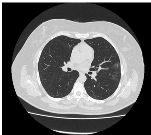
Fig. 2 – Chest computed tomography (CT) image in first day of hospitalization. The image demonstrates two ground glass opacities in peripheral area of left upper lobe. The patient had few bilateral, peripheral ground glass opacities.

Brazil, was admitted to a local hospital on April 14, 2020. The patient complained of sore throat, anosmia and ageusia for the past 12 days, and frontal headache, fever, dry cough, mild dyspnea without need for supplementary oxygen and SpO 2 94% on room air for five days. IgM and IgG antibody tests for DENV (SERION ELISA classic Dengue Virus IgM and IgG, Serion Inc., Brazil) were initially negative, whereas real-time reverse transcription – polymerase chain reaction (RT-qPCR) for SARS-CoV-2 (in-house laboratory developed test targeting N1 and E genes 4 performed on a nasopharyngeal specimen) was positive. Blood samples showed leukopenia (2260/mm 3 ), lymphopenia (497/mm 3 ), thrombocytopenia (143,000/mm 3 ), and elevated D-dimer (3986 ng/mL), C-Reactive Protein-CRP (16 mg/L), serum alanine aminotransferase (ALT 60 U/L), aspartate aminotransferase (AST 40 U/L), and ferritin (559 ng/mL). Chest computed tomography (CT) images demonstrated few bilateral, peripheral ground glass opacities (Fig. 2). The patient