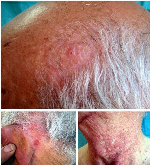
Figure 1. Ulcerated lesion of the scalp (top) and a crusted lesion of the retroauricular area (bottom left). When regressing, some of the lesions left a whitish scar (bottom right).