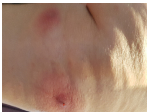
Fig. 1 – Boil-like lesions with serosanguinous secretion.

Two days later, on September 13, she noticed a pale, non-tender nodule on her lower vermilion border on the right side