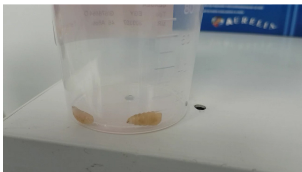
Fig. 2 – Two of the four extracted larvae.

of the lips. She was advised to apply petrolatum jelly to the area. This nodule experienced involution over the next four days. There was no evidence of larval presence in this lesion.