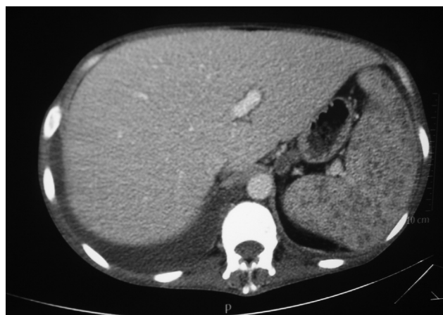
Fig. 3 – Hypodense nodular lesions in the liver and spleen, and mesenchymal multiple lymphadenopathy in the abdominal CT.

Initiation of antiretroviral therapy (ART) in HIV-infected patients leads to restoration of the immune functions. On the other hand, dysregulated immune response after initiation of ART leads to the phenomenon of Immune Reconstitution