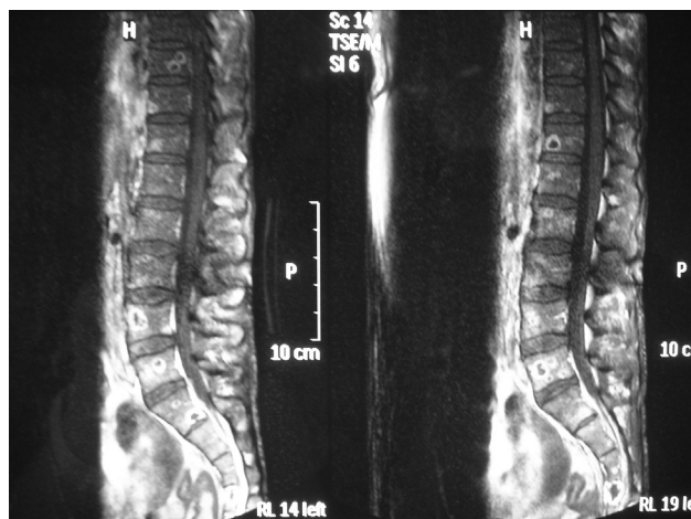
Fig. 4 – Multiple nodular lesions (tuberculomas) in the vertebral corpus in spinal MRI.

Initiation of antiretroviral therapy (ART) in HIV-infected patients leads to restoration of the immune functions. On the other hand, dysregulated immune response after initiation of ART leads to the phenomenon of Immune Reconstitution