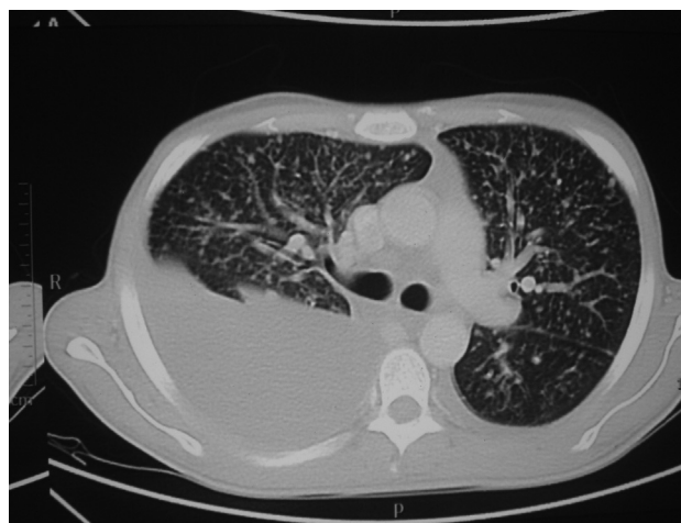
Fig. 1 – Massive pleural effusion in the right hemithorax, diffuse bilateral micronodular infiltration in both lungs, and hilar lymphadenopathy in thoracic CT.

A 29-year-old male patient was admitted at the hospital with complaints of diarrhea and weight loss that had started two months ago. In his physical examination and laboratory tests, HIV positivity was detected (CD4 cell count 175 \text{ mL}^{-1} , HIV RNA 9,800,000 copies/mL). At the end of the first month of antiretroviral therapy he was admitted to the hospital again with deterioration in his general medical condition, respiratory distress and loss of consciousness. Massive pleural effusion in the right hemithorax, and diffuse bilateral micronodular infiltration in both lungs were detected by thoracic computerized tomographic (CT) examination (Fig. 1). A lesion (tuberculoma) was observed in the cranial magnetic resonance imaging (MRI) (Fig. 2). There were hypodense nodular lesions in the liver and spleen, and mesenchymal multiple lymphadenopathy (LAP) in the abdominal CT (Fig. 3). Mycobacterium tuberculosis grew on the 35th day after pleural fluid culture in Löwenstein Jensen culture media. Treatment with antituberculosis agents and 60 mg prednisolone was started. Bilateral distal motor and sensory neuropathy developed during follow-up. Multiple nodular lesions (tuberculomas) were detected in the spine in spinal MRI (Fig. 4). 1 The patient was discharged on the second month of treatment with partial recovery.