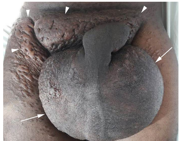
Fig. 1 – Enlarged scrotum (arrows) and diffuse skin thickening (arrowheads).

A 42-year-old black male, Brazilian farmworker presented with pain and progressive swelling of the scrotum for three years. He also had lower-limb edema, enlarged lymph nodes of the right groin, neck, and sternal furcula. A cervical lymph-node biopsy showed non-specific chronic inflammation. Serologies, including HIV, were negative. The nodule in the right groin increased in volume and gave rise to fistulization and purulent discharge. A chest X-ray was normal. Physical examination revealed a very enlarged scrotum with thickening of the skin and purulent discharge (Fig. 1). Computed tomography (Fig. 2A) and pelvic magnetic resonance imaging (Fig. 2B) showed a very enlarged scrotum with extensive subcutaneous thickening, and inguinal lymphadenopathy with multiple fistulous tracts in the skin. The left testicle had a reduced size, without testicular expansive lesions, and there was also bilateral hydrocele. Lymphoscintigraphy revealed an obstructive process in the inguinal region suggesting lymphatic involvement. The biopsy specimen of the right inguinal skin showed the “ship’s wheel” appearance of yeast forms budding from the central parent yeast on silver stain, consistent with paracoccidioidomycosis (PCM) (Fig. 3). Serology for Paracoccidioides