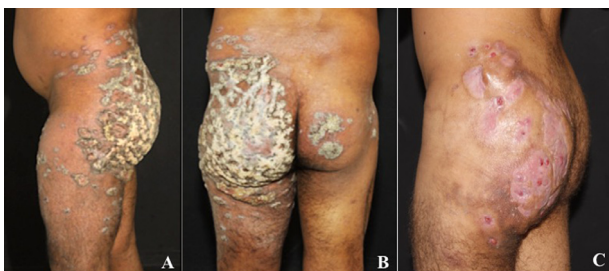
Fig. 1 – A 26-year-old male farmer presented a verrucous plaque in the left side of the buttock (A), that spread to the right one (B). A marked improvement of the skin lesions caused by M. tuberculosis was observed after treatment, performed with rifampicin, isoniazid, pyrazinamide and ethambutol during six months.

A 26-year-old male farmer, residing in Belém, Pará State, Brazil, presented to the outpatient service of Dermatology