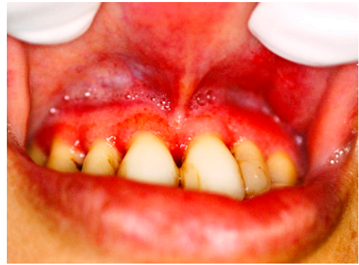
Fig. 4 – One month of antifungal therapy leading to reduction of clinical lesions.

infection. 3,4 Herein, the patient was in the sixth month of pregnancy and showed no immunological changes. These facts make the diagnosis of the systemic fungal infection unexpected.