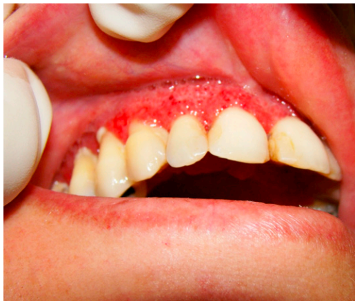
Fig. 2 – Presence of multiple painful moriform ulcers in the upper gum, palate, and upper lip.