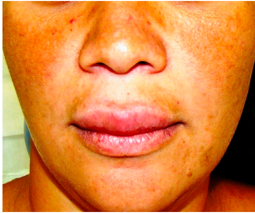
Fig. 1 – The lesion in upper lip was granulomatous cheilitis-like.