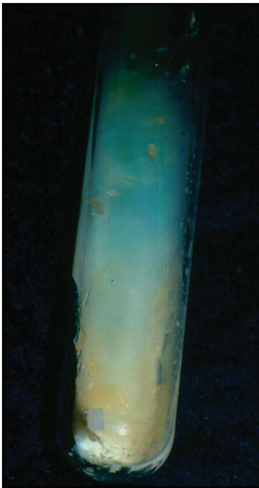
Figure 3: Loewenstein-Jensen mean, after treatment with N acetylcysteine/NaOH: Mycobacterium avium complex (Runyon's group III: non-chromogenic).