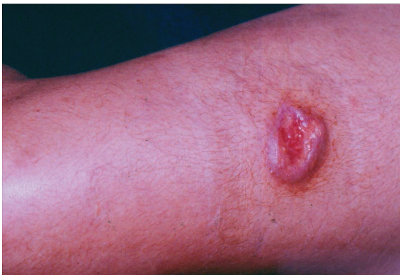
Figure 1: Ulcerated lesion on the left thigh.

Submitted on: 09/24/2009 Approved on: 10/27/2009