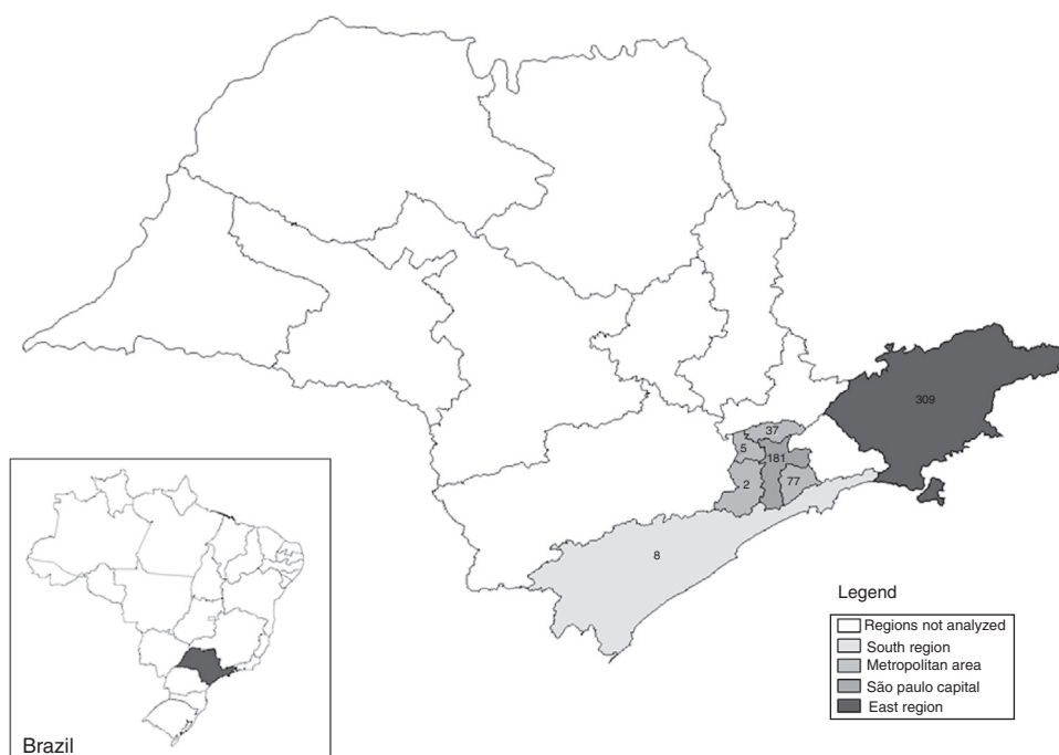
Fig. 1 – Map of Brazil highlighting the state of São Paulo and the regions where the samples for HCV viral load measurement were collected. The number of samples from each region is depicted.

HCV viral loads were abstracted from laboratory records and analyzed according to the type of viral infection or co-infection.