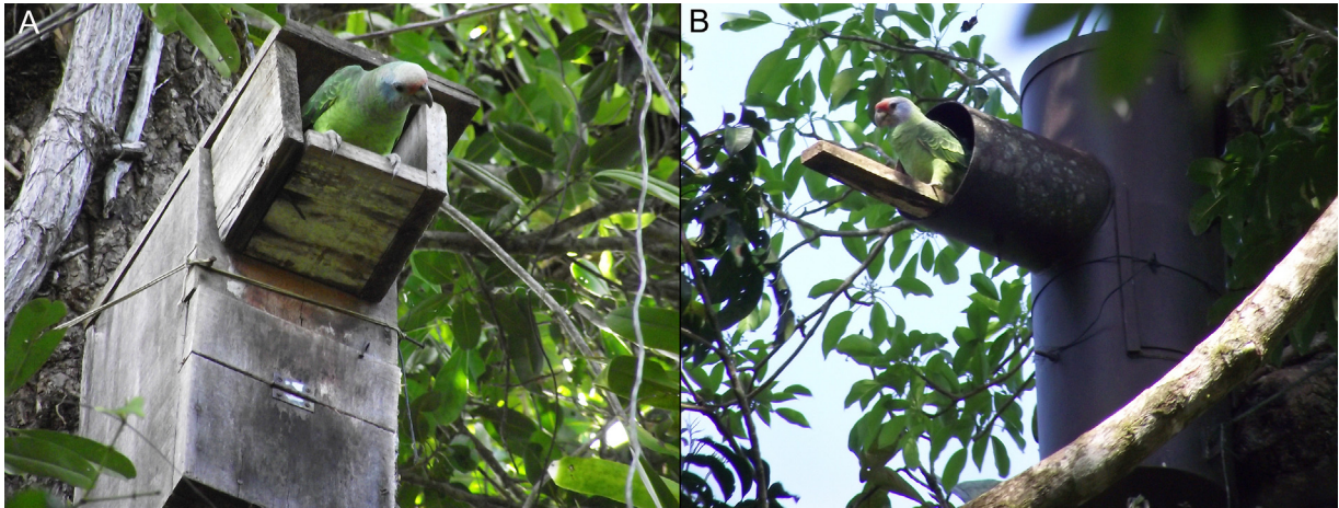
Fig. 1 – Red-tailed Amazon parrot in a wooden (A) and polyvinyl chloride (B) nest in Rasa Island, Paraná, Brazil.

The kit provides the following biochemical tests: tryptophan deaminase reaction, hydrogen sulfide production, glucose fermentation, gas production from glucose, L-Lysine decarboxylation, indole production, decarboxylation