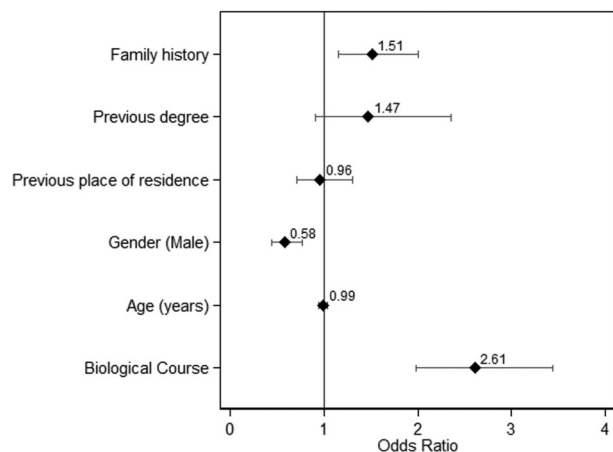
Figure 2. Odds ratios and 95% confidence intervals for mentioning cardiac massage among first-year undergraduates at the University of São Paulo Ribeirão Preto Campus (2013 academic year).

television programs are foreign, and provide, for example, the United States pre-hospital emergency number (911) instead of the Brazilian one (192). In practice, 5% of those who did not write down the correct MEAS/SAMU number answered 911, despite the MEAS/SAMU number being clearly marked on every public ambulance.