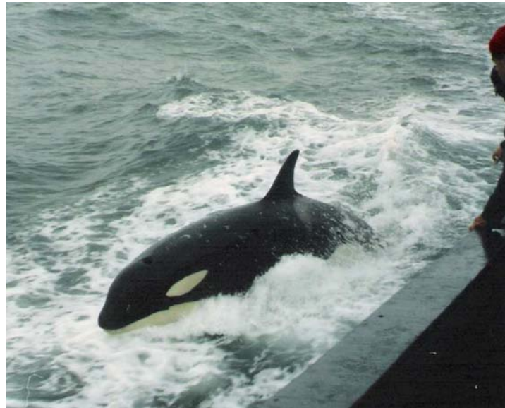
Fig. 6. A juvenile killer whale ( Orcinus orca ) riding close to a research vessel from CETESB in shallow waters of São Sebastião in September 1988.