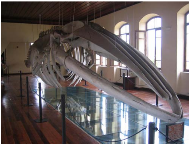
Fig. 2. An 18-m long skeleton of a fin whale ( Balaenoptera physalus ) found washed ashore at Peruíbe in 1941. It is on exhibition at Museu do Instituto de Pesca, Santos.

• Eubalaena australis Desmoulins, 1822: Two right whale tympanic bullae (MZUSP-2758 and 19837), collected in Iguape in 1902, were reported by Castello and Pinedo (1979). Sightings and strandings were recently updated by Lodi et al. (1996) and Santos et al. (2001a). A total of eight strandings were reported between 1936 and 2000 (see updated list in Santos et al., 2001a). Another stranding occurred on 15 August 2007, of a 4.5 m long male found at Itanhaém (CEEMAM-319). Most stranding records (67%) related to calves, three occurrences of which were related to individuals presenting vestiges of the umbilical cord.