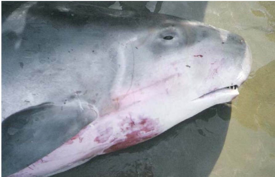
Fig. 5. Pregnant pygmy sperm whale ( Kogia breviceps ) of 288cm washed ashore at Santos on 11 July 2000 (CEEMAM-090).

• Berardius arnuxii Duvernoy, 1851: The only known occurrence of this species on the SP coast was reported by Siciliano; Santos (2003). On 04 August 1993, a 7 m long Arnoux beaked whale in an advanced state of decomposition was observed floating in São Sebastião coastal waters. It was buried and recovered six months later when the correct identification based on cranial features was made. The whale's nearly complete skeleton, without a collection number, is on exhibition at the Balneário dos Trabalhadores, São Sebastião.