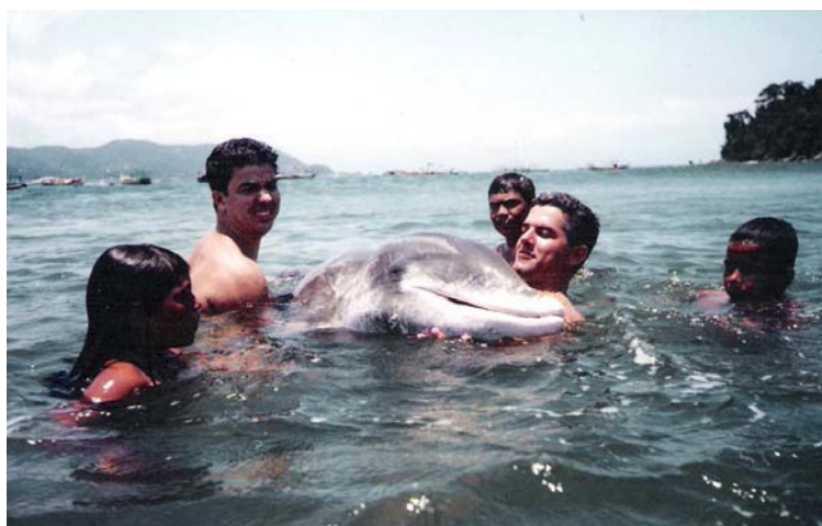
Fig. 8. A 250 cm long male rough-toothed dolphin ( Steno bredanensis ) with volunteers after its stranding on 28 December 1998 (CEEMAM-055), before it left the area.

• Tursiops truncatus (Montagu, 1821): Forty unpublished stranding records of bottlenose dolphins are listed in Table 6. A nearly complete T. truncatus skeleton was collected on the Praia da Juréia on 12 July 1986 (MZUSP-20382), but no further information was available. A male bottlenose dolphin, captured in Santa Catarina state (27°S) in 1983 for display at a small facility in São Vicente, was sighted in May 1994 in the southern waters of the SP coast after its release at the selfsame spot at which it was captured in April 1993. It was freeze-branded on both sides of its dorsal fin for tracking purposes. Subsequently it was observed in Cananéia estuarine waters (25°S) for at least two days (Fig. 9) and then it moved northwards to Santos (24°S), where it was frequently seen interacting with swimmers for three