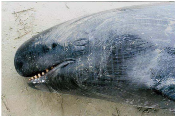
Fig. 7. A 4.3 m long male false killer ( Pseudorca crassidens ) found dead at Bertioga on 31 May 2005 (CEEMAM-219).