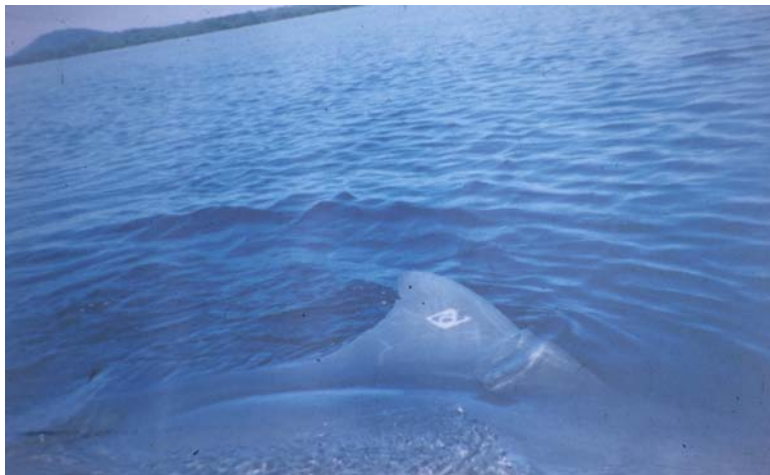
Fig. 9. Male bottlenose dolphin ( Tursiops truncatus ) named “Flipper” released from captivity in southern Brazil (27°S) in 1993 and found in April 1994 in the estuary of Cananéia (25°S). The Brazilian flag had been freeze-branded on its dorsal fin.