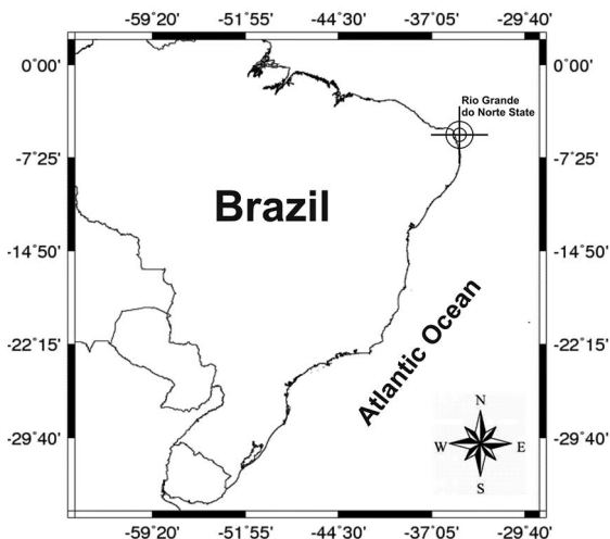
Figure 1. Sampling area: Rio Grande do Norte State, Brazil.