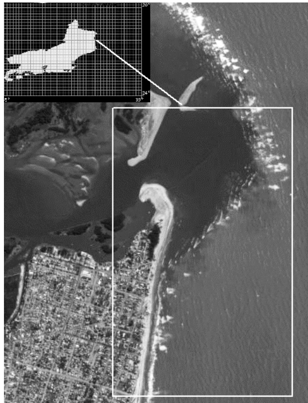
Fig. 1. Location of the area under investigation.

(Fig. 1), has experienced severe coastal erosion (ARGENTO, 1989). In consequence, tens of houses have been destroyed by the erosion as well as by foredune migration.