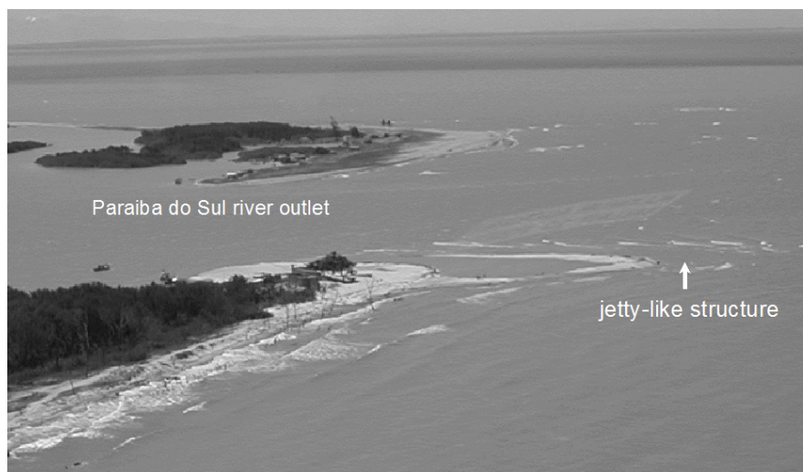
Fig. 3. A partially buried jetty forming a barrier to the passage of river sediments.