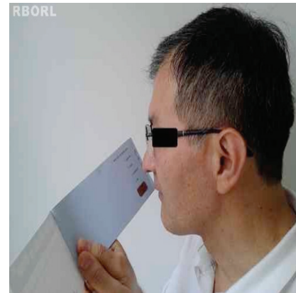
Figure 1 Male patient undergoing smell identification test (SIT) with booklet positioned at 1 cm from the nose.

was created by Doty et al. 7 in 1984 and recently adapted for the Brazilian population by Fornazieri et al. 8,9 This is an easy-to-use method with adequate reliability, suitable for outpatient use.