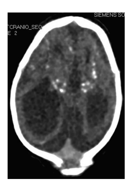
Figure 2 Axial encephalic tomography. Note the malformation of cortical development and calcifications.

Computerized tomography revealed diffuse bilateral reduction of cerebral parenchyma, ventriculomegaly, malformation of cortical development, with simplified gyral pattern and multiple cerebral calcifications predominantly in the basal ganglia and cortical-subcortical regions (Fig. 2). Capture ELISA was positive for ZIKV IgM on the cerebrospinal fluid (CSF). Polymerase chain reaction (PCR) tests for Herpes simplex in serum were negative; PCR tests for