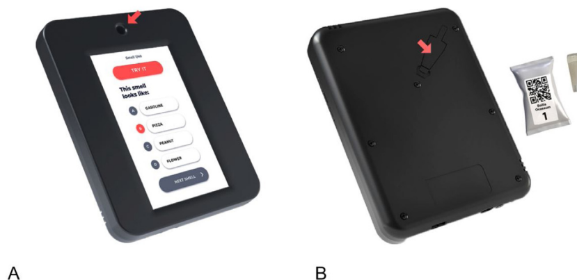
Figure 3 (A) Front view of the Noar MultiScent-20® digital device. It is a 7-inch touchscreen tablet used to digitally demonstrate aromas. The odor release opening is indicated by an arrow. (B) Rear view of the device. Capsule with individual odor storage. The capsules are loaded through an insertion port (arrow) on the back of the device.

eligibility criteria tailored to the local context, considering the regional characteristics of the disease, resource availability, and the funding of the healthcare system. Faced with the diverse realities around the world, certain guidelines may not be directly applicable in other regions, a fact that may pose challenges and create confusion for medical teams and national regulatory agencies in the indication and funding of these treatments.