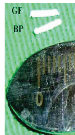
Figure 3 Materials studied. GF, Gelfoam (absorbable gelatine sponge); BP, sponge of sugarcane biopolymer.