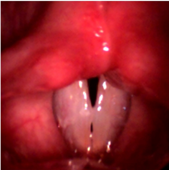
Figure 3 Frame of the high-speed videolaryngoscopy video referring to Case 2. Presence of bilateral lesion between the anterior and middle third is observed; the position is symmetric, with double chink (mid-posterior triangular and anterior fusiform).

the video was replayed, and the number of times was written down. The video was reproduced over again at every protocol parameter. The researcher took notes of judge-raters' responses.