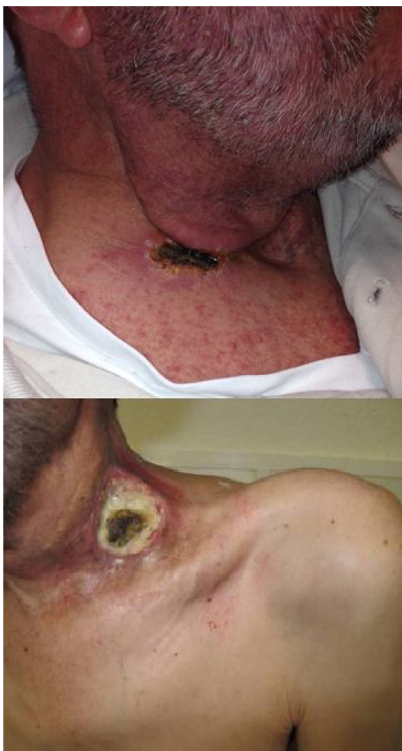
Figure 1 Electrochemotherapy early skin reaction: Dry crust (up) or Ulcer (down).

declined offered treatments. Inclusion and exclusion criteria are shown in Table 1 following EURECA guidelines for mucosal and skin cancers. 12,13