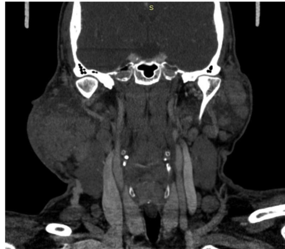
Figure 2 Computed tomography of the neck (coronal view) showing bilateral diffuse enlargement of the parotid glands, right more than left, multiple nodules of varying sizes in the superficial and deep lobe of both glands. Both the internal jugular veins and carotid vessels are preserved.

clear bilateral fossa of Rossemullers and normal laryngeal structures.