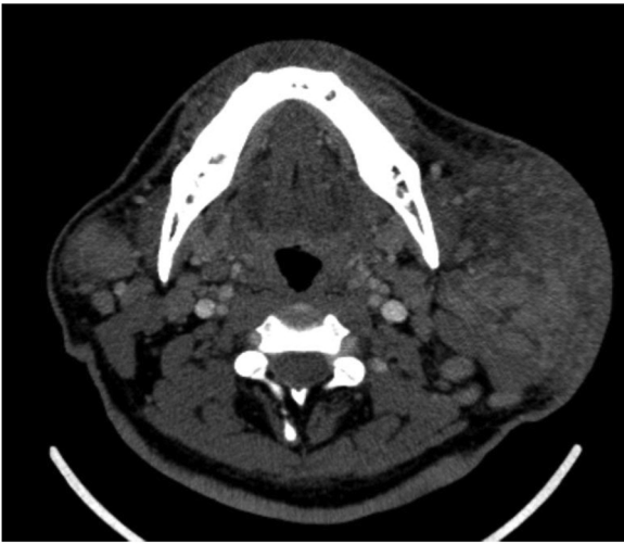
Figure 1 Computed tomography of the neck (axial view) showing extensive fat streakiness of overlying subcutaneous tissue plane with skin involvement over the right. There is no focal enhancing collection seen within the glands.