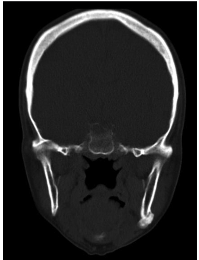
Figure 3. 2-year postoperative: Coronal view showing a recurrence in the left mandible angle.

The three cases located in the condyle caused facial asymmetry, dental malocclusion and consequent functional deficit (Figures 4 and 5).