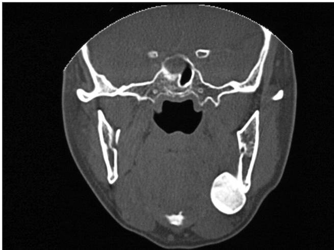
Figure 1. Preoperative aspect: Coronal CT scan showing a peripheral osteoma in the left mandible angle.

There was one recurrence two years after the surgery (Figures 1, 2 and 3). A new surgery was done, and we did not have signs of recurrence after three and a half years of follow up.