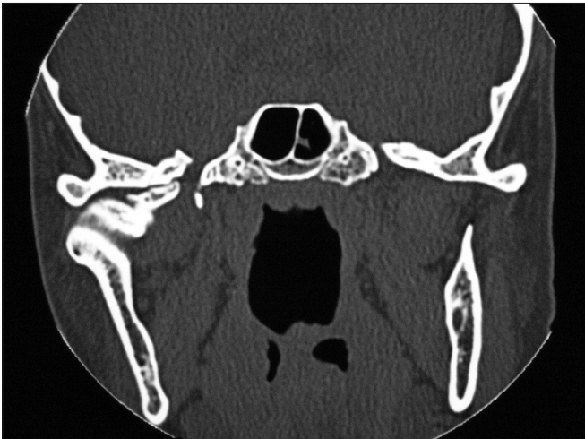
Figure 5. Coronal CT scan: peripheral osteoma in the right-side mandible condyle.

are large enough to cause facial asymmetry or some functional deficit.