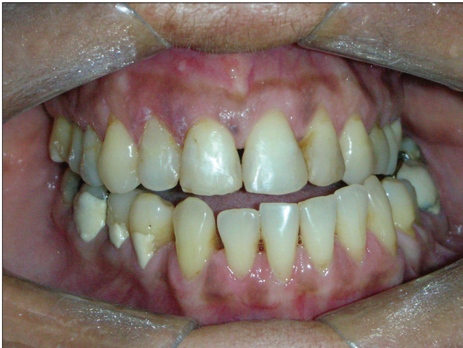
Figure 4. Occlusal changes: deviation from the midline and cross-bite caused by osteoma in the right mandible condyle.