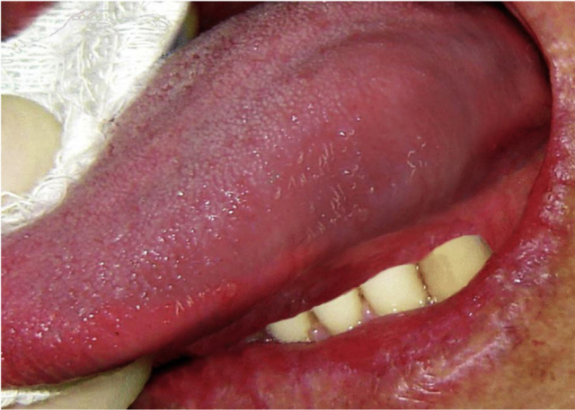
Figure 1 Clinical lesion presented as a swelling of lateral border of the tongue.