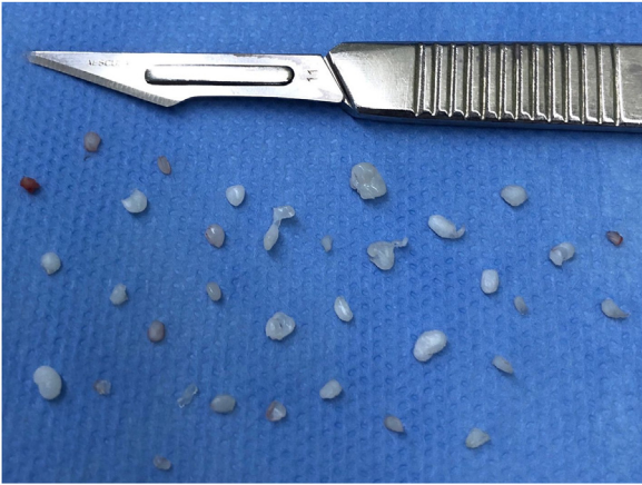
Figure 2 Free bodies of TMJ synovial chondromatosis removed during arthroscopic surgery.

of internal TMJ disorders, CS can cause restricted otological complaints, however, arising from a joint pathology, even without presenting signs and symptoms common to temporomandibular disorders. A possible explanation for this fact is that the greatest amount of chondromatosis free bodies was present in the retrodiscal region, a region of great innervation and TMJ sensitivity, causing this patient's reflex otalgia.