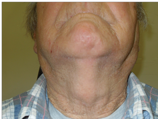
Figure 1. Patient with bilateral parotid enlargement and liposubstitution seen upon MRI.

would justify them, after the pertaining diagnostic investigation, by means of an image exam, laboratorial and/or anatomic-pathological tests (Figure 1). In these cases, our investigation encompasses a complete blood count, antiSSB, anti-nucleus factor, rheumatoid factor, HIV, anti-HCV, Schirmer test, minor salivary gland biopsy, neck MRI, scintigraphy and, in selected cases: sialography.