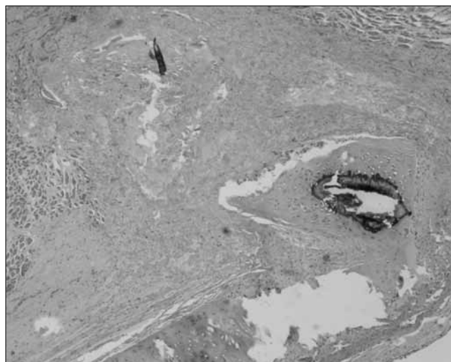
Figure 2. Hematoxylin-eosin. 40X - right vocal fold. Fascia graft in the vocal muscle of a rabbit euthanized after 60 days. Note mild scarring in the vocal muscle. The implanted fascia may be seen.

We did not investigate the absorption rate of fascia. The graft was not found in three cases; we therefore chose to exclude these cases from the study, since it could not be established whether the fascia had been absorbed or extruded. Reijonen et al. 6 found injected fascia lata grafts up to 12 months later in the vocal fold of dogs. Thus, we do not believe that fascia was absorbed after 60 days in our study. In one case the window was not fixed to the larynx (rabbit 14, group II), which may explain graft loss in this case. Tsunoda et al. 11 and Nishiyama et al. 12 described wound closure with absorbable 7.0 sutures in the direct laryngoscopy techniques; the purpose